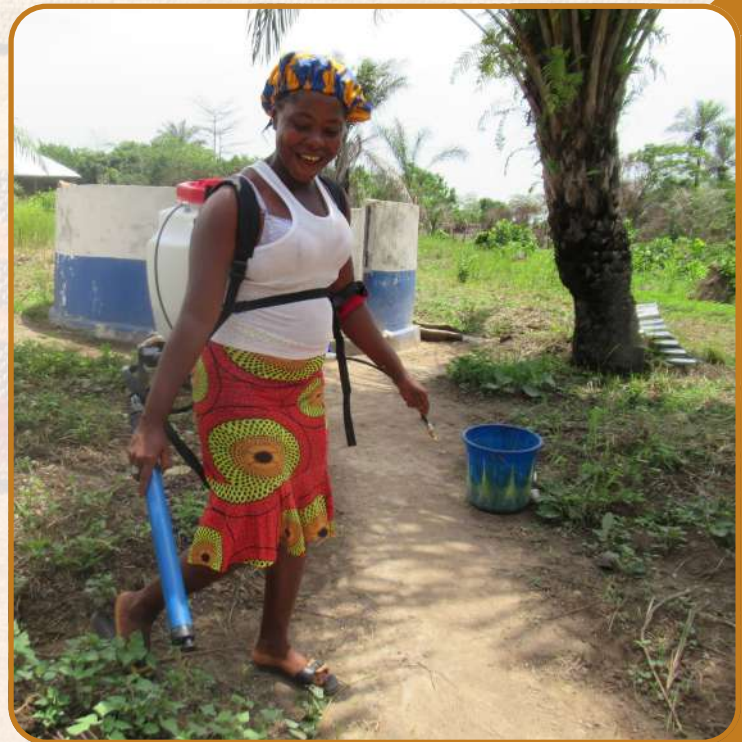
agricultural training courses for women and youth to teach them the best farming practices, as well as provide them with the seeds, fertilizers, and tools they need to grow bountiful harvests.

But thanks to the supporters of Bread and Water for Africa®, we have been working for years with our grassroots partners in Sierra Leone, who offer